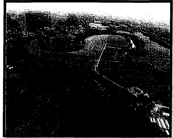
Riparian forest buffers are a best management practice used to reduce water pollution

A Nine Element Watershed Management (9E) Plan is a type of clean water plan that details a community's water quality concerns and a strategy to address these concerns. 9E Plans are developed by people who live and work within the watershed with support from local and state agencies. The nine minimum elements are intended to ensure that the contributing causes and sources of nonpoint source pollution are identified, that key stakeholders are involved in the planning process, and that restoration and protection strategies are identified that will address the water quality concerns.